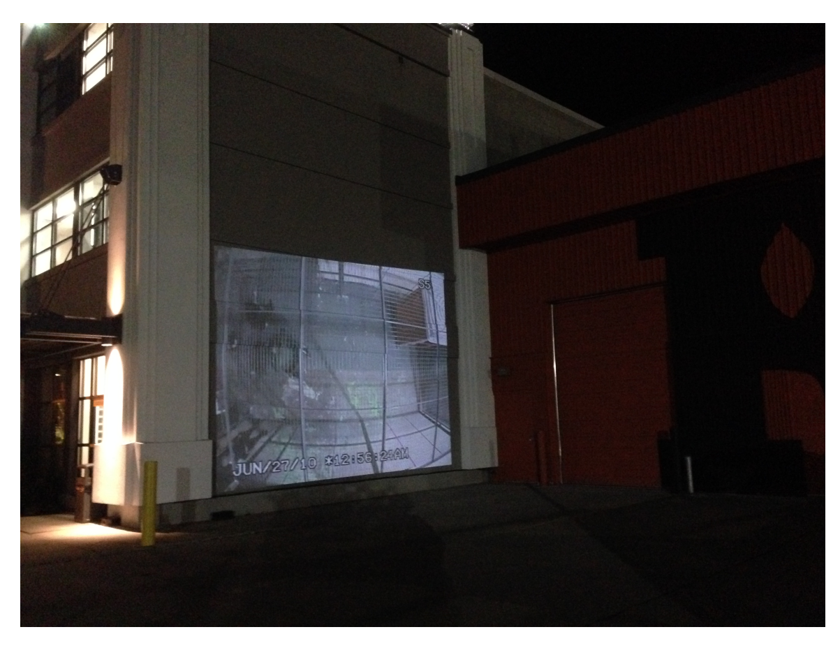
Eastern Avenue film studio that was converted into a detention centre during the G20.