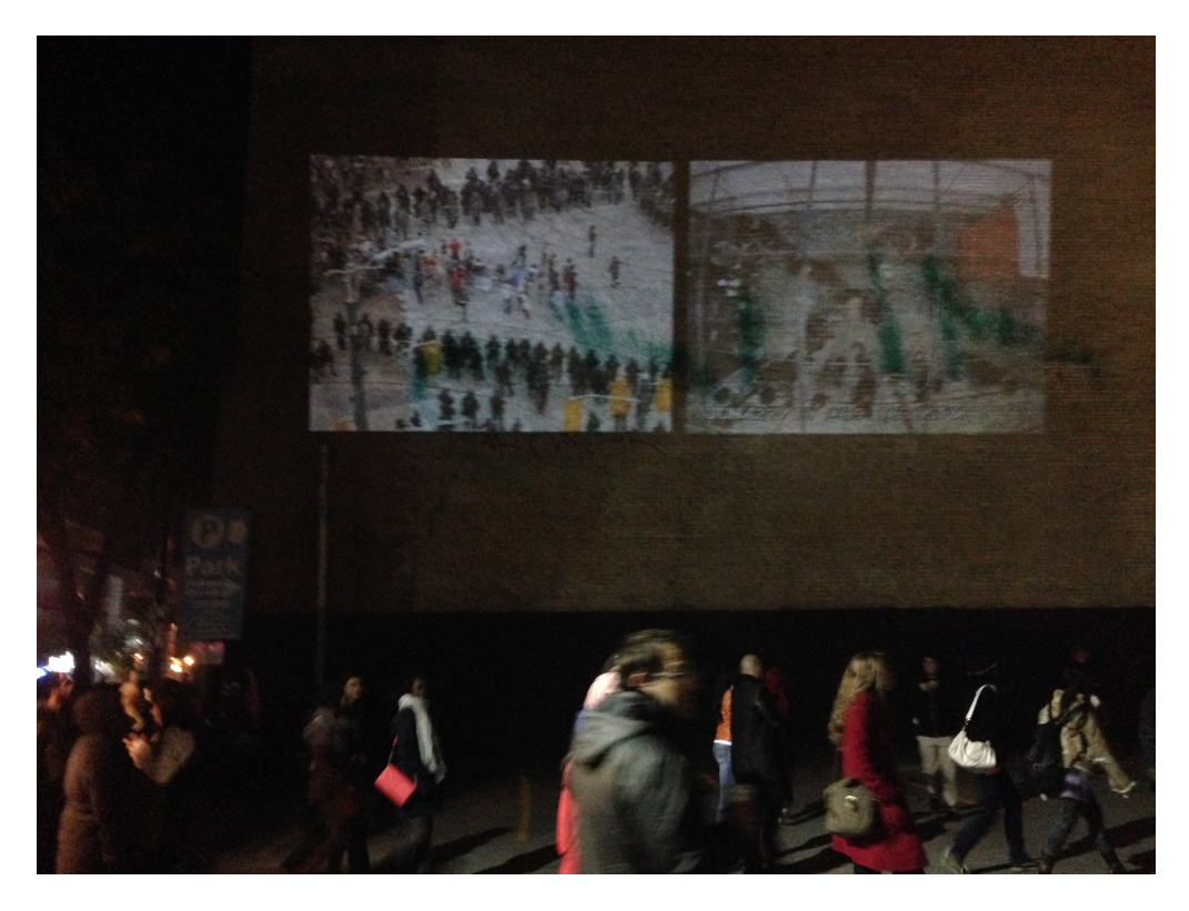
Spadina & Queen: on the left, footage of kettling, and on the right, a crowded detention cage.