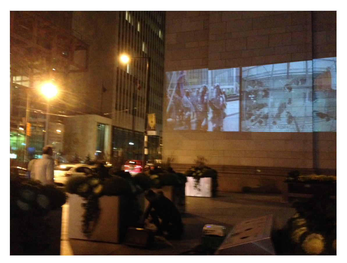
King & Bay, Toronto: the site of the arrest of Gabe Jacobs on June 27, 2010

Here are images of Test #1: Cages, taken as it interrupted and intersected with Nuit Blanche on October 4-5, 2014: